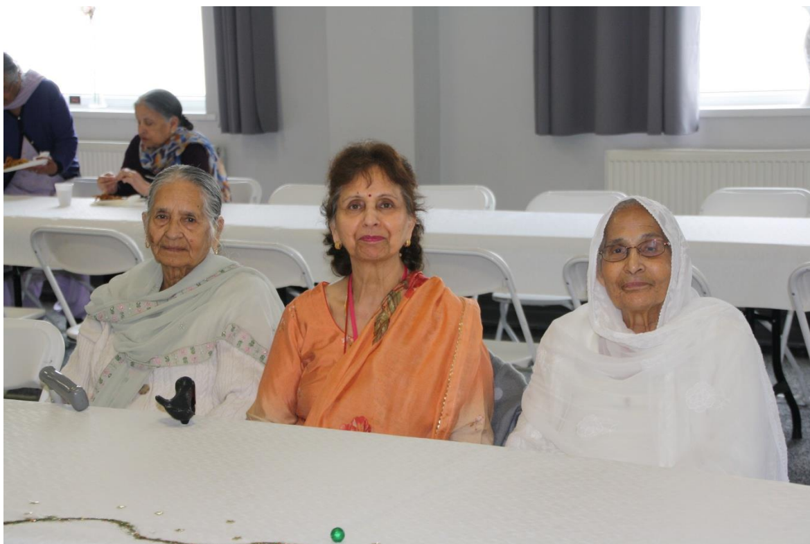
Happy faces of our Service Users.