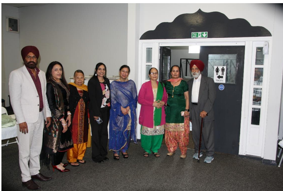
Organisers with the guests and volunteers.