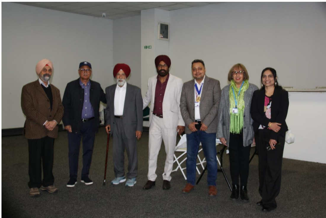
Committee members of the Sikh Community centre with the esteemed guests.