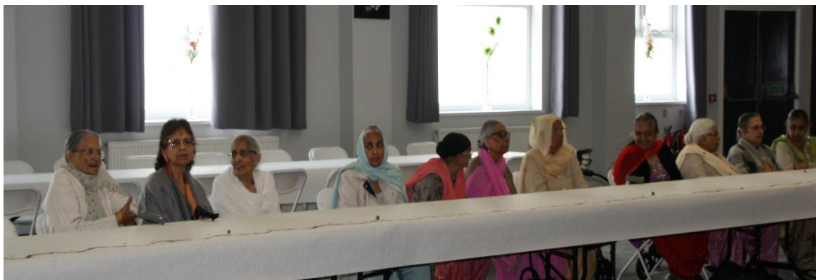
APNA Service Users.